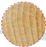
NATURAL VENEER DISPOSITION